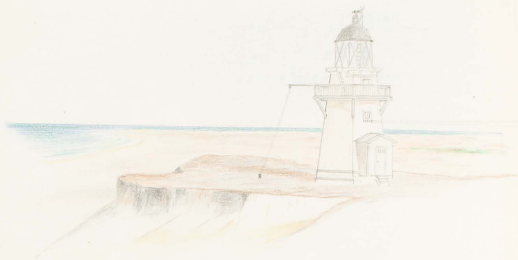
Kaipara Light 1902

Sketch made from photograph in Auckland Institute and Museum.